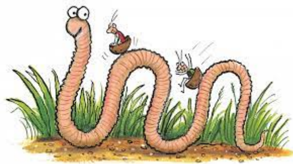
Figure 2: I am thankful you taking care of my home.